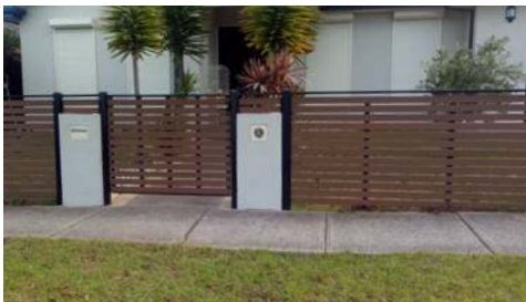
Slats as Fencing Panels