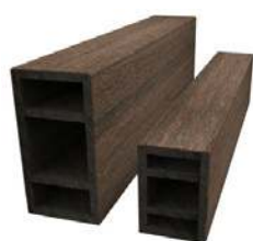
UH25 and UH17 (Ipe)