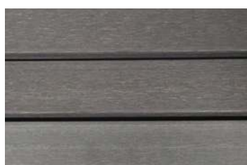
US36 (Silver Grey)